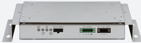
VTK-62B + VTK-62B1-BK