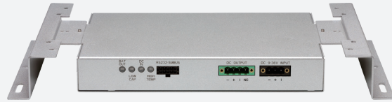
VTK-62B + VTK-62B2-BK