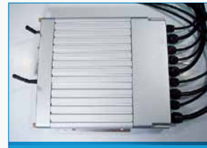
VTC 6100 with optional IP65 enclosure