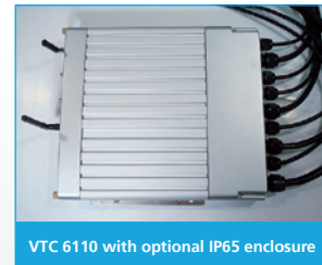
VTC 6110 with optional IP65 enclosure